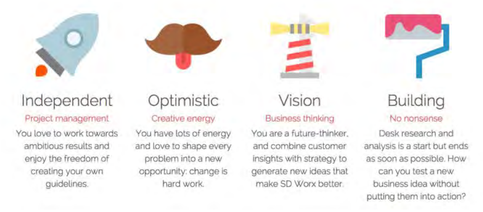
Image taken from "The perfect intrapreneur: a skillset", The Innovation Blog

Being ambitious and having an open mindset is a must, the rest you can learn.